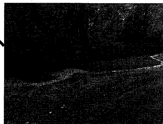
East Side of Property/Common Area